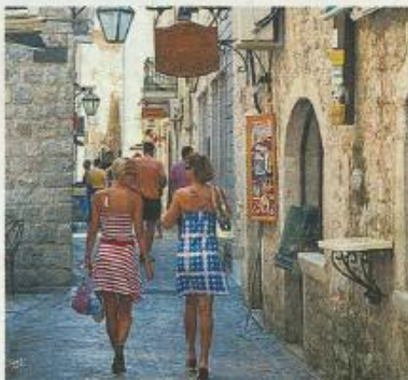
HISTORIC STREETS: Alleys in Kotor Old Town take travellers back in time

New direct flights are set to open Montenegro up to the British holiday market. NICK BOULOS explores the Balkan Peninsula's best-kept secret