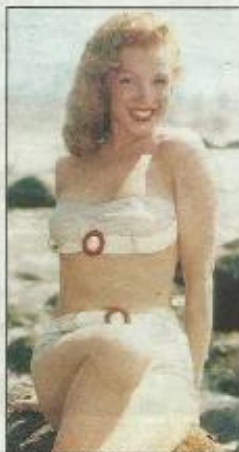
BEACH BELLE Marilyn was a visitor

walled island once frequented by the likes of Sophia Loren and Marilyn Monroe. Its red-roofed houses are tightly clustered and seemingly hewn directly from the rocks in places.