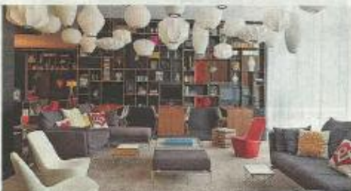
STYLISH BREAK: Award-winning citizenM combines great style with comfort

The one-night break of Champneys in Tring, Herts, includes tennis-based drills and activities, coaching sessions and a lifestyle evening talk and Q&A session with Kate. Players can also unwind with a soothing Thalassotherapy Pool session in